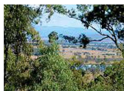
The land at Limestone Ridges where the foundation plans to build.

The group received a recent boost in its quest to fund the es-